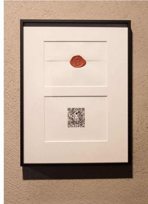
Installation view of physical CryptoPunks and sealed envelope at 'Perfect & Priceless - Value Systems on the blockchain' show, @ Kate Vass Galerie in Zürich, 2018.